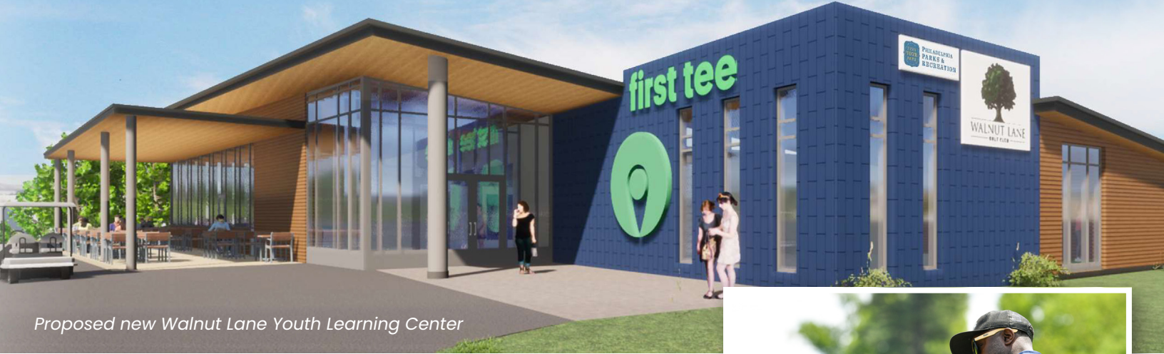
Proposed new Walnut Lane Youth Learning Center

F IRST TEE - GREATER PHILADELPHIA teaches over 45,000 local youth essential life skills while providing equal access to the lifelong game of golf. We impact the lives of all young people by providing educational programs that build character, instill life - enhancing values, and promote healthy choices through the game of golf.