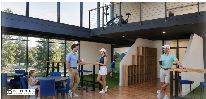
Student Locker Area