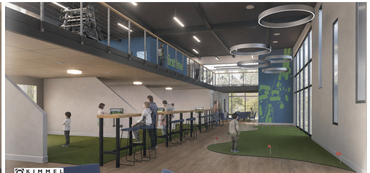
Simulator Bay (4)