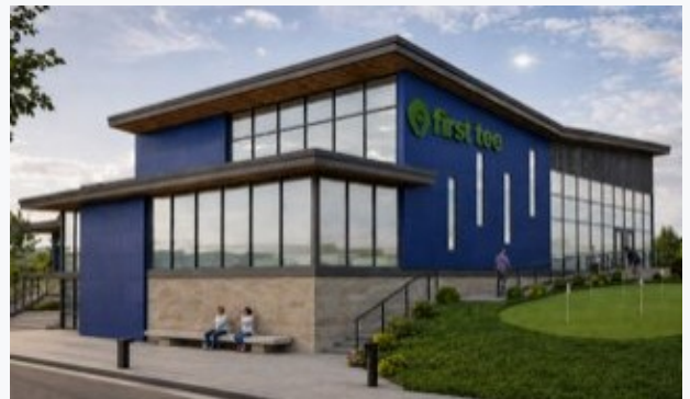
Rendering by Kimmel Architecture

In recognition of this gift, the donor's name – or a mutually agreed-upon name – will be prominently displayed on the exterior of the building.