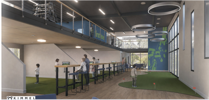
Indoor Practice Green

ARCHITECTURAL RENDERINGS BY KIMMEL ARCHITECTURE