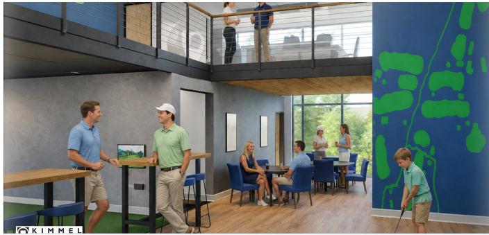
First Floor Workspace

ARCHITECTURAL RENDERINGS BY KIMMEL ARCHITECTURE