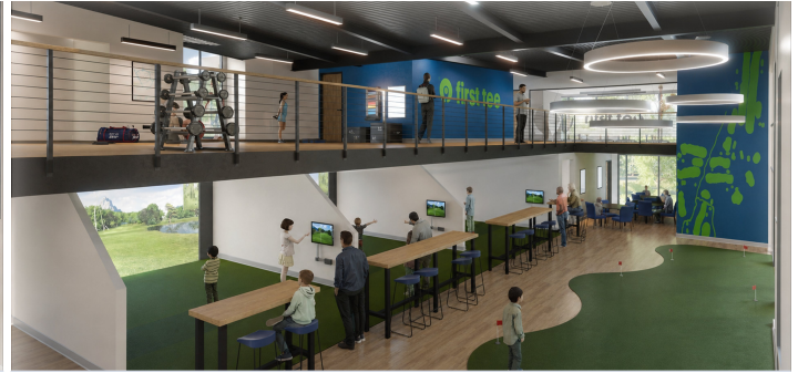
Second Floor Flex Space