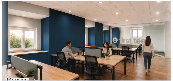
First Tee Staff Office